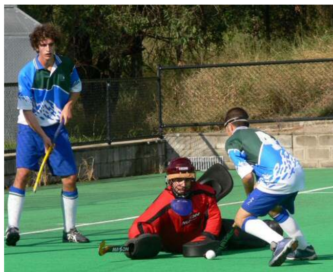
BHL1 - Pine Rivers St Andrews Norths v Eastern Suburbs