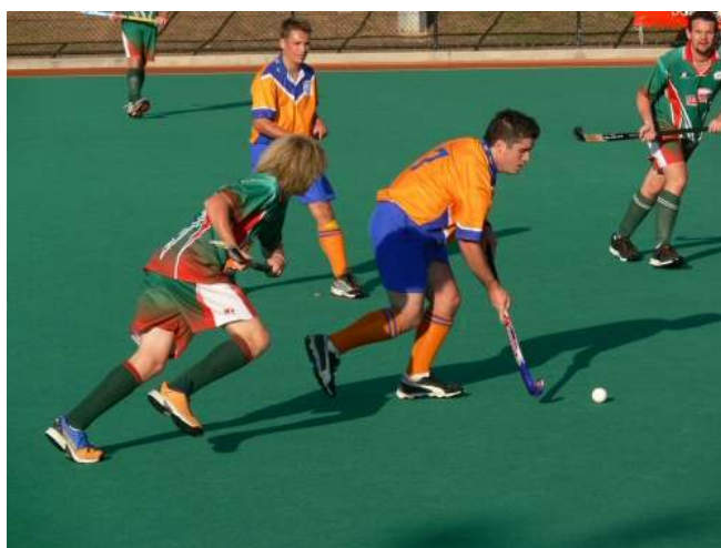
BHL2 - South West United v Redcliffe Leagues