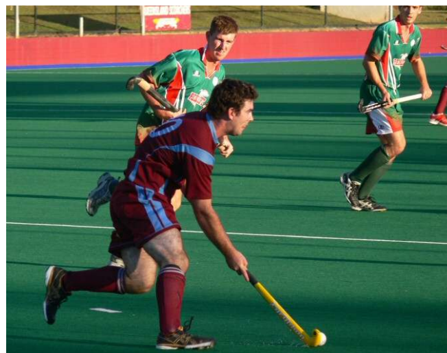
BHL1 - University of Queensland v Redcliffe Leagues