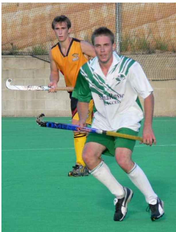
BHL1 - Bulimba v Eastern Suburbs