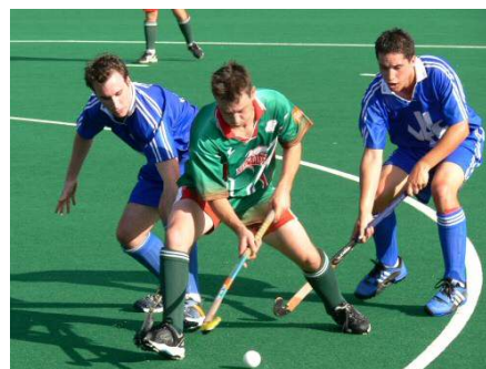
BHL1 - Valley v Redcliffe Leagues