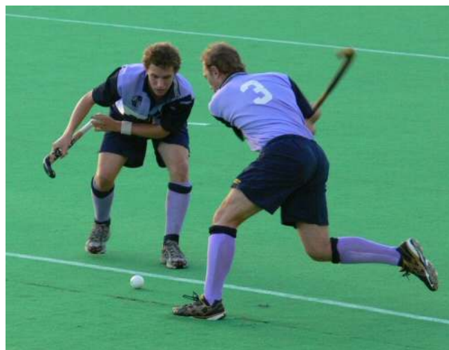
BHL1 - Commercial – executing a Penalty Corner