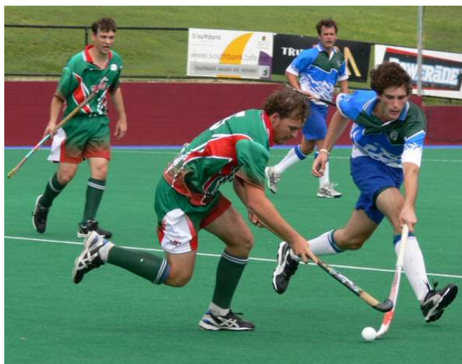
BHL1 - Redcliffe Leagues v Pine Rivers St Andrews Norths