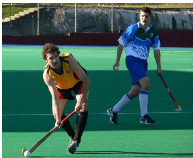
BHL1 - Eastern Suburbs v Pine Rivers St Andrews Norths