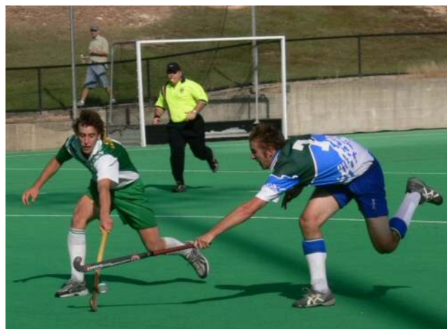
BHL1 - Bulimba v Pine Rivers St Andrews Norths