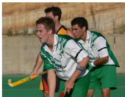
BHL1 - Bulimba v Eastern Suburbs