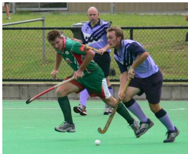
BHL1 - Commercial v Redcliffe Leagues