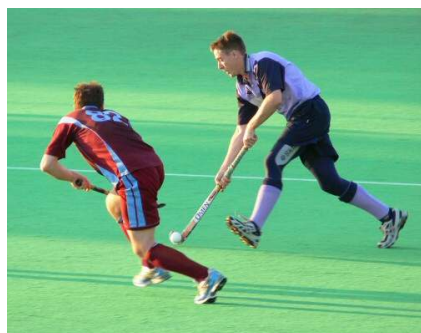
BHL1 - University of Qld v Commercial

Key: (#) – Minor Premiers (t) – Presidents Trophy winner (m) – Memorial Cup winner (r) – Premiership Runner-up (P) – Premiership Winners. Club names in bold – teams in Finals Series